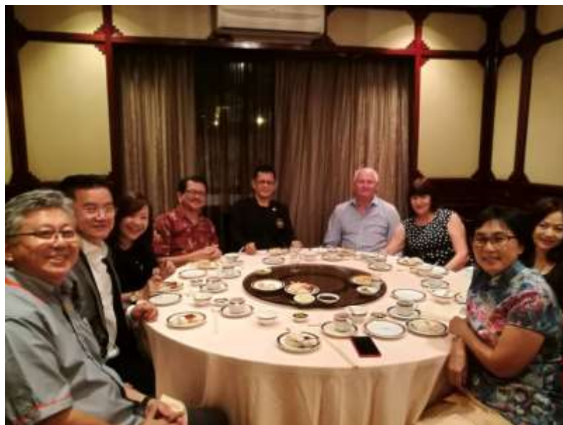
Some FGBMFI Malaysian board members at Chinese banquet