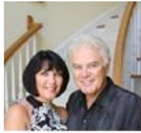
Written by Bob & Debby Gass Reasons for discontent

'They have dug...cracked cisterns that can hold no water at all! Jeremiah 2:13 NLT