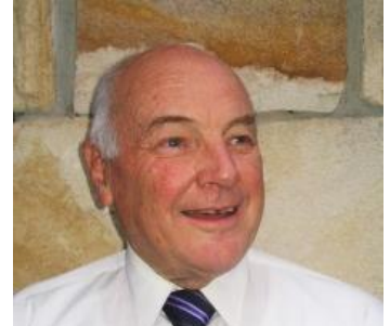
Another true story from the experiences of a long-time member and friend.